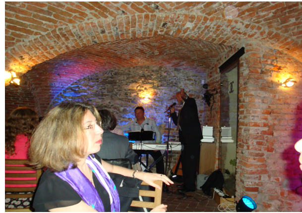
Visiting the beautiful city of Kosice....